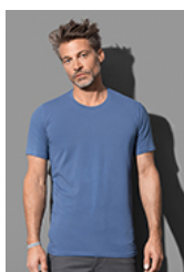
ST9600 Clive Crew Neck